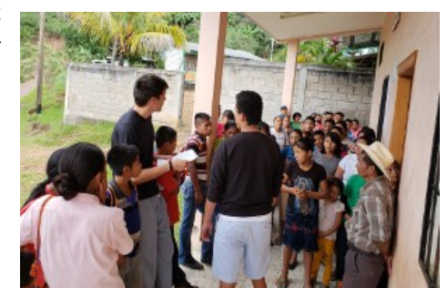
Scholarship day is extremely busy. For poor families there is no other option to continue school beyond 6th grade.

Clearly, the community views education as being highly important and given the poverty in the area, the scholarships are a lifeline for those fortunate enough to receive them. The scholarship process contained two main components. The first was to ensure that those who had been receiving scholarships in the past could continue to do so. The second was to enroll new scholarship applicants entering both 7th and 10th grades. Each component required us to collect a lot of information. The students who were reapplying for scholarships had to submit a large packet of documents containing attendance records, homework hours, volunteer service hours signed off by one of the community elders, a budget sheet, a thank