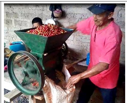
Depulping coffee "cherries"