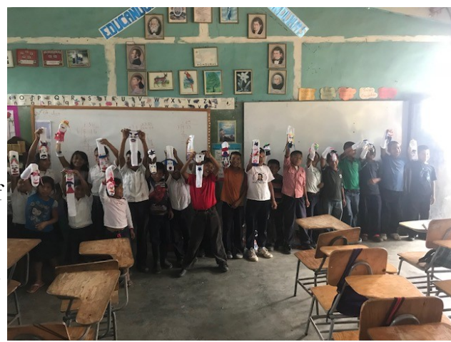
Students and their non-violence sock puppets

you letter to their sponsor back in Rochester, a personal photograph and of course, their report cards. Thank God for spread sheets because without the organization they provided, it would have been a nightmare. The new scholarship applicants had to submit a questionnaire that evaluated the students' family's financial need, a short quiz that evaluated the student's writing ability, a personal photograph, and of course, their report cards. We were able to complete the vast majority of both components over the course of one day that went swimmingly due to the help of all the team (attendings, residents, translators). It was lovely to see the smiling faces of the children as they came to submit their required documents. It was particularly rewarding to see so many of the children