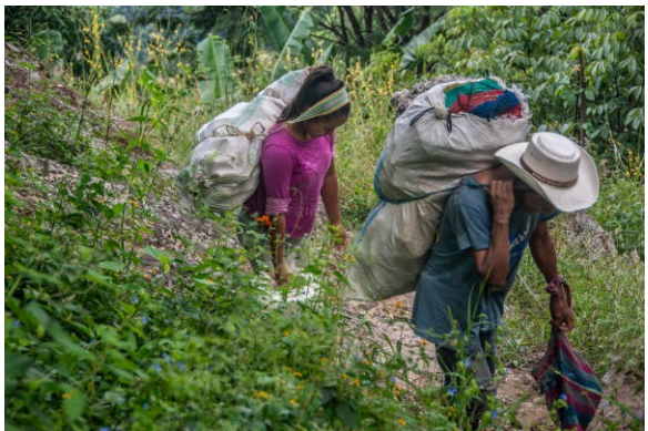
There is no flat ground in San Jose. Everyone must work very hard carrying heavy loads on their backs up and down mountains