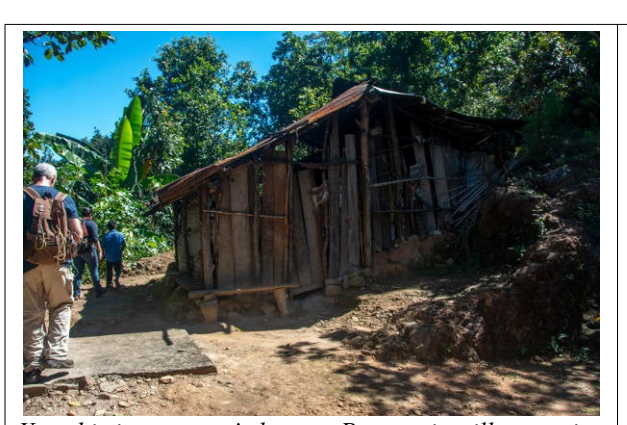
Yes, this is someone's house. Poverty is still pervasive in San Jose