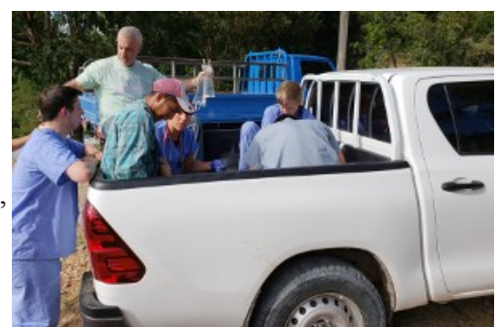
Trying to save a life from the back of a pick up truck

Keeping her neck stable, we transferred her into the back of the